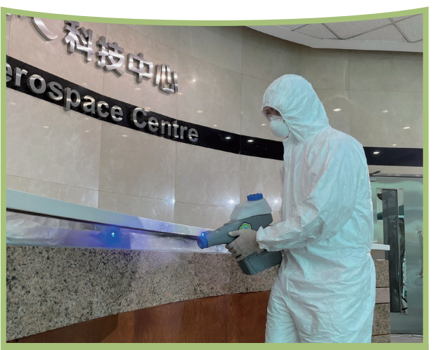
We are the exclusive distributor of SD Labs' surface coating products, which have been reported to be effective in killing the COVID-19 virus and a number of other viruses.

As our frontline workers continue to report duty during the coronavirus disease 2019 ("COVID-19") pandemic, they may expose to significant risks of pandemic when handling the waste. Therefore, we have implemented a series of precautionary measures to reduce their health risks. Frontline employees have been provided with gloves, face masks, safety goggles and isolation gowns, and they are required to wear them properly at work. Instructions for extra precautionary measures have been given to our frontline employees while dealing with suspected vomitus, excreta, respiratory secretions and disposed face masks.