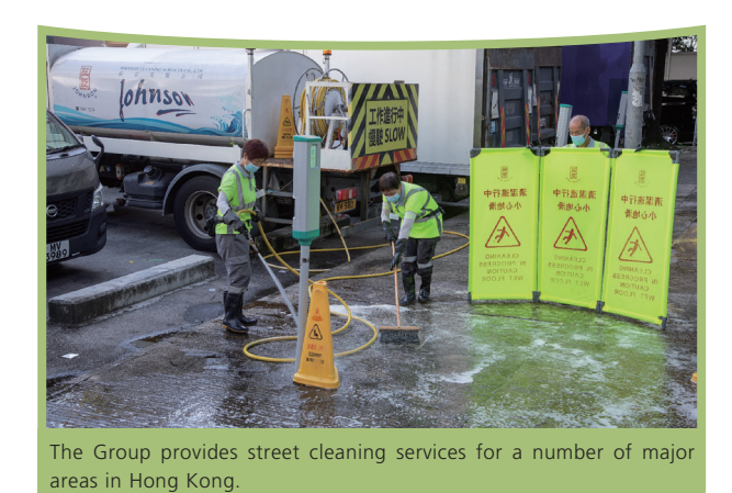
Our frontline workers receive professional training regularly, so as to provide high standard cleaning services.

Hong Kong Johnson Holdings Co., Ltd. (hereinafter referred to as the "Company" or "Johnson Holdings", and together with its subsidiaries, the "Group" or "we"), is a leading environmental hygiene service provider which offers cleaning services for buildings, streets, institutions, parks and recreation centres in a number of major areas in Hong Kong, as well as garbage logistics service and agency services of innovative environmental hygiene technology products and equipment. With a wide range of environmental hygiene services we provide, we aim at growing into an integrated environmental hygiene service provider.