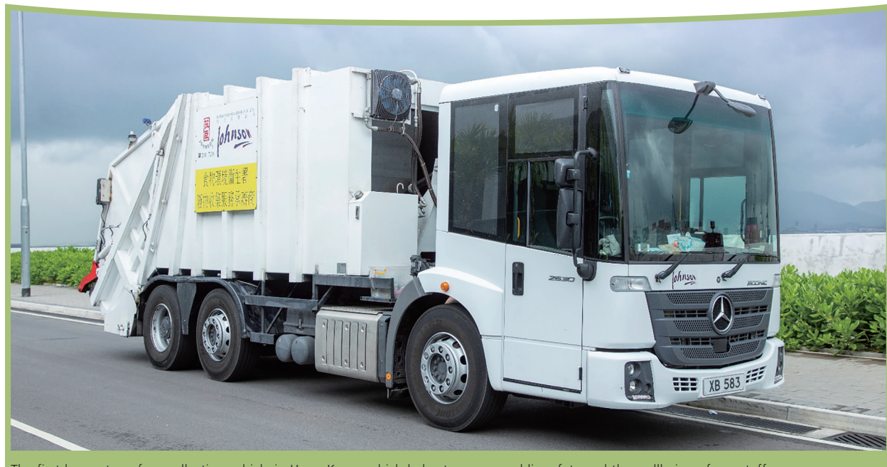
The first low entry refuse collection vehicle in Hong Kong, which helps to ensure public safety and the wellbeing of our staff.

We have been integrating technology into our day-to-day operations to enhance our operational safety. This includes the introduction of the first low entry refuse collection vehicle in Hong Kong. The new vehicle significantly minimises the potential OSH hazards of our frontline refuse collection workers by reducing the risk of getting injured when getting on/off the vehicle and by enabling a broader visibility of the driver.