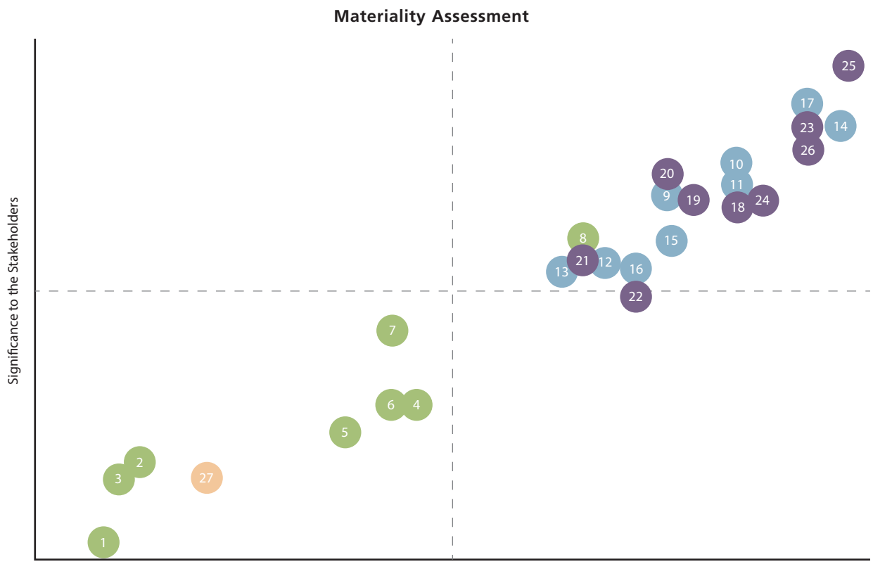
Significance to the Group's Business and Operation